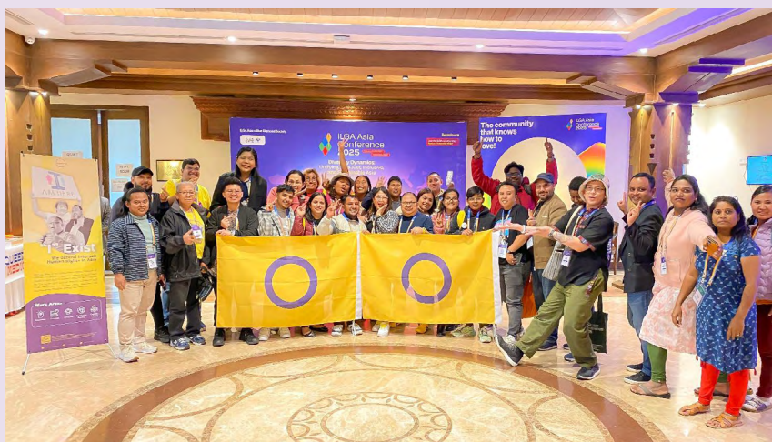
Intersex community at the Intersex Pre-conference, ILGA Asia Conference 2025, Kathmandu, Nepal

The event facilitated rich discussions and collaborative activities, which helped participants identify priorities and develop impactful recommendations for stakeholders. Below are listed a few key priorities and recommendations to the key stakeholders.