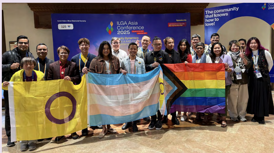
Intersex Asia and other allies at the ILGA Asia Conference 2025, Kathmandu, Nepal

These seven network organisations will reconvene soon to engage in discussions regarding funding opportunities and to outline strategies for collaboration. In addition, this meeting will explore various avenues for financial support as well as to develop a cohesive plan for working together effectively on shared objectives.